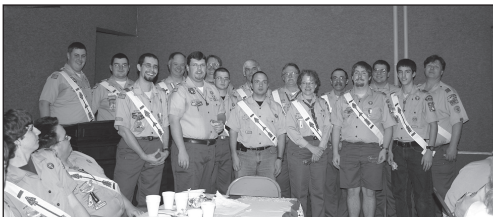
Pictured above: Kuskittanee Lodge members who gave 50 hours or more of service to Camp Bucoco in 2005 were recognized at the annual banquet held in February.